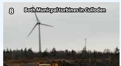
8 Both Municipal turbines in Culloden