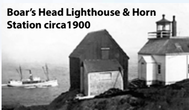
Boar's Head Lighthouse & Horn Station circa 1900