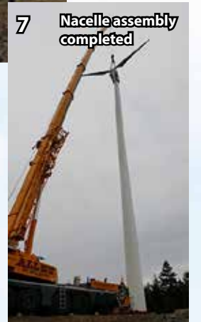
7 Nacelle assembly completed