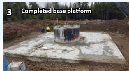
3 Completed base platform