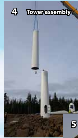
4 Tower assembly