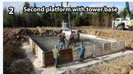
2 Second platform with tower base