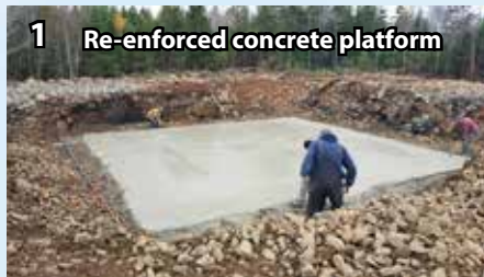
1 Re-enforced concrete platform