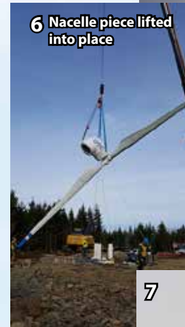
6 Nacelle piece lifted into place